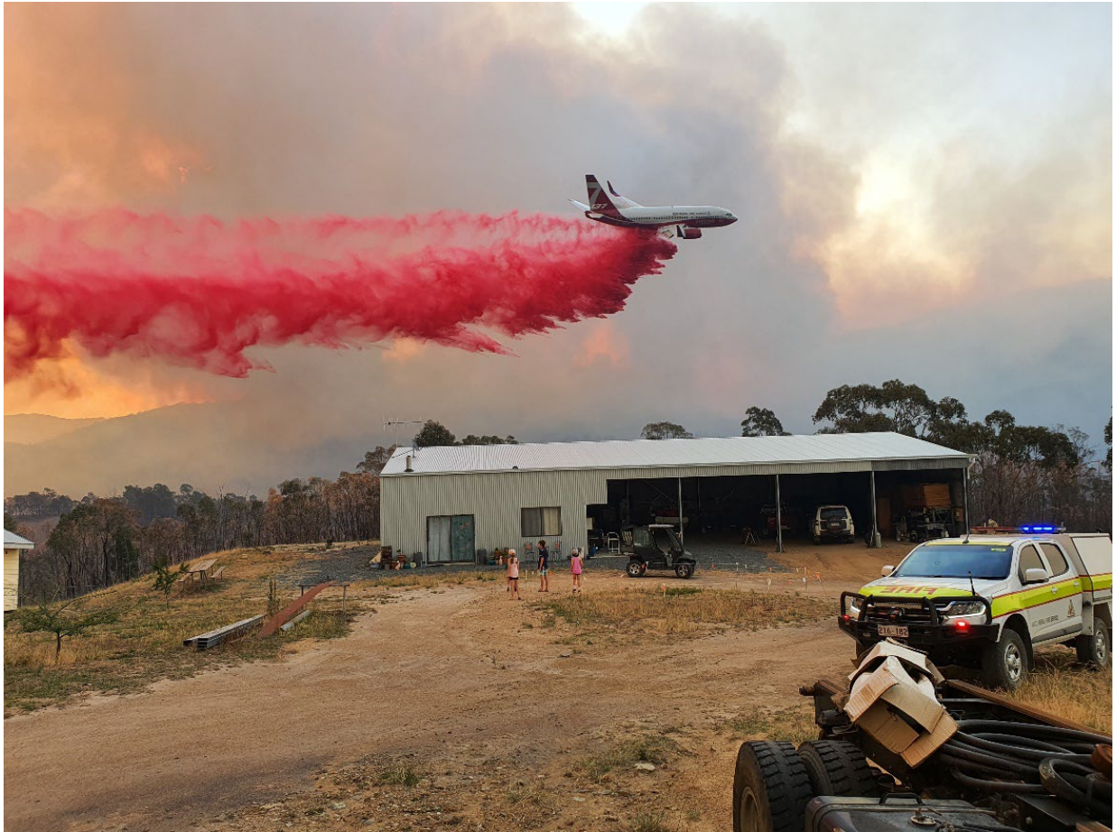
Large airtanker undertaking asset protection on a rural property during 2020 Orroral Fire