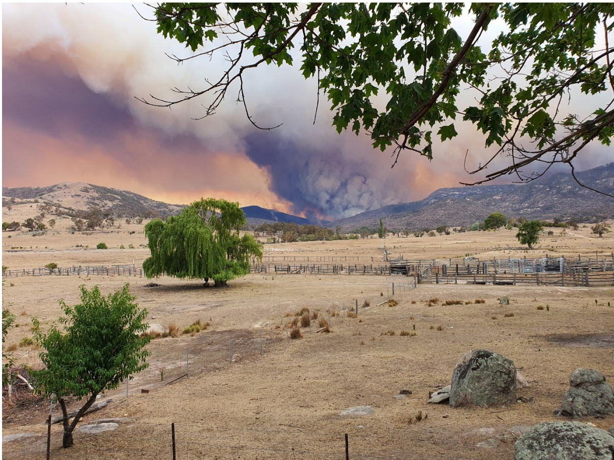
A view of the 2020 Orroral Fire burning within Namadgi National Park, taken from a Rural Property near Tharwa

Rural landholders are also encouraged to develop and review their emergency survival plan, to ensure it is up to date and that they are familiar with it.